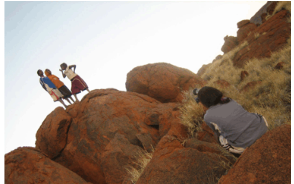
Ngapartji Ngapartji - Pukatja girls. Photo courtesy of Ngapartji Ngapartji team