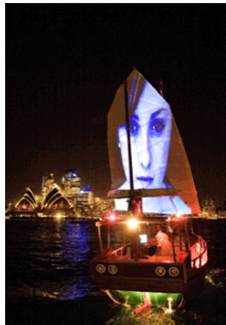
Junk Theory .

Ngapartji Ngapartji is a long term, inter-generational language arts project based in Alice Springs. The project seeks to highlight the status of indigenous languages and generate a national and international groundswell with a desire to maintain and preserve these languages. This includes the development of the "ninti site"—an