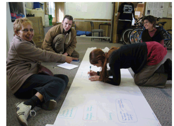
Ngapartji Ngapartji - Language lesson planning