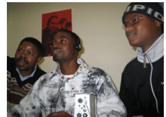
Participants of the refugee radio collective.