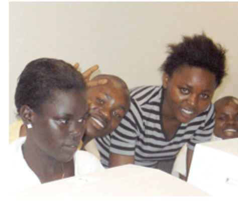
storybox: write your life online : a blogging project for young African refugees.